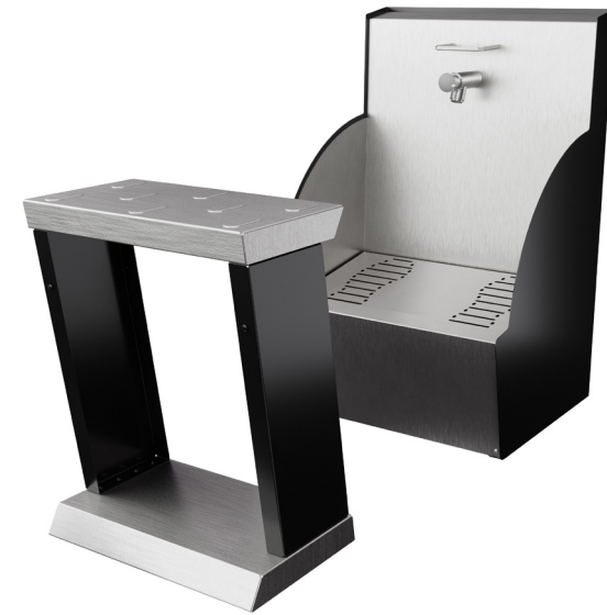
WUDU Wash Station & Stool Combinations