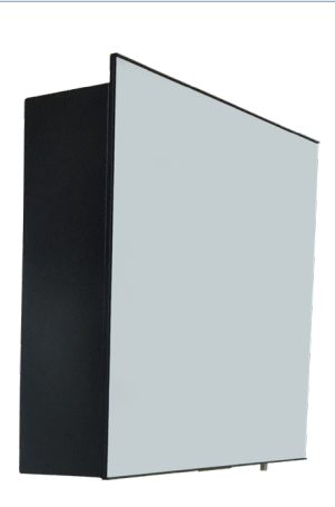
Modulo Behind the Mirror

Utilise the concealed space behind a mirror.