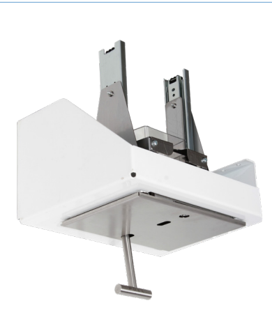
Classic Behind the Mirror

A suite or dispensers designed for ease of use to help aid independence.