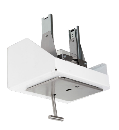
Classic Behind the Mirror Utilise the concealed space behind a mirror.