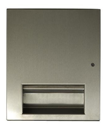
Recessed Units Maximise the space available in washrooms by recessing essential units.