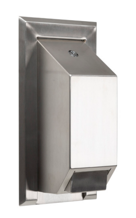
Anti Ligature Range Helping to safeguard vulnerable washroom users without compromising on style.