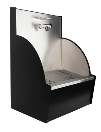
Specialist Washstations Hygiene solutions for all spaces.