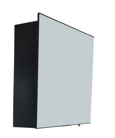
Modulo Behind the Mirror Space saving hand hygiene tailored to your washroom.