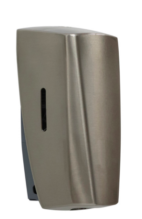
Platinum Range A contemporary suite of products to add a touch of class to washrooms.